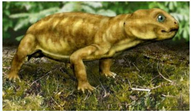
Myosaurus, a Triassic reptile of Antarctica.

What happened during this journey is recorded in Antarctica's rocks and is summarised below, from the most distant past to the present. (mya = million years ago).