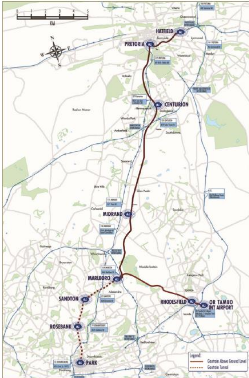
Fig 1. Gautrain Aerial System Map