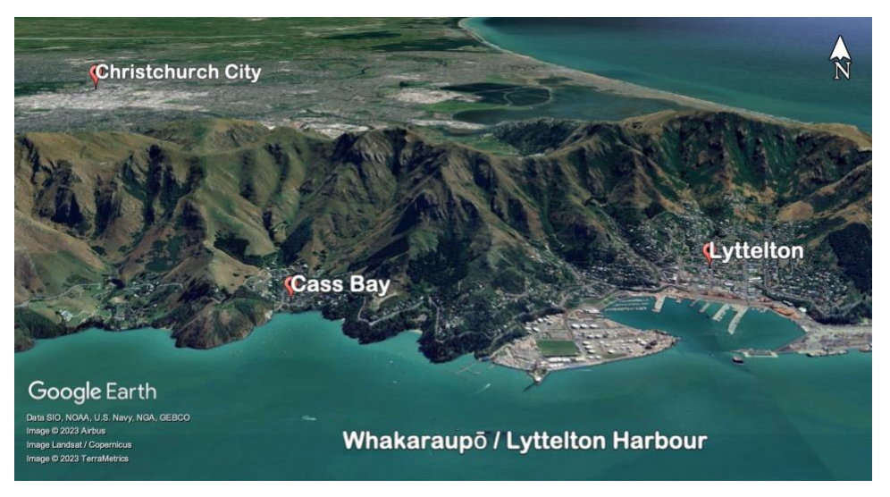
Figure 1. Cass Bay, situated southeast of Christchurch City.