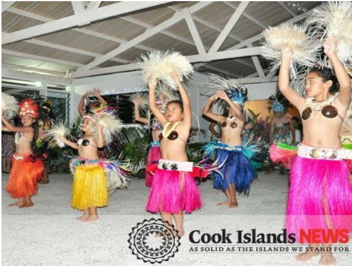
14 Cook Island dancers

The Cook Islands has 15 islands in the group and the main language is Cook Island Māori and English. The outer islands have their own dialects as well. Parliament has 24 elected members and elections held every five years. At the time of my research the current Prime Minister was Jim Marurai and his deputy Sir Terepai Maoate. While the current population is 14,200, 15 the Cook Islands has, like neighbouring Niue, suffered a decline in population due to large numbers migrating to New Zealand and other countries for better opportunities. Under the terms of free association with New Zealand, Cook Islanders hold New Zealand citizenship and have rights to free access to New Zealand.