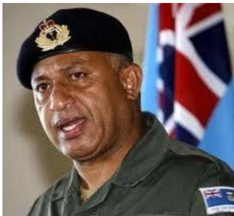
39 Commodore Frank Bainimarama

it again in the future. What is very clear is that as long as the current military regime is in place in Fiji, it remains risky to be a true journalist, or to be outspoken in any manner be it as a church leader in the Methodist Church or as a foreigner trying to do a job in Fiji. There is on-going hope and pressure internationally that freedom of the media to operate as it should might be restored in places like Fiji sooner rather than later, but that still remains to be seen.