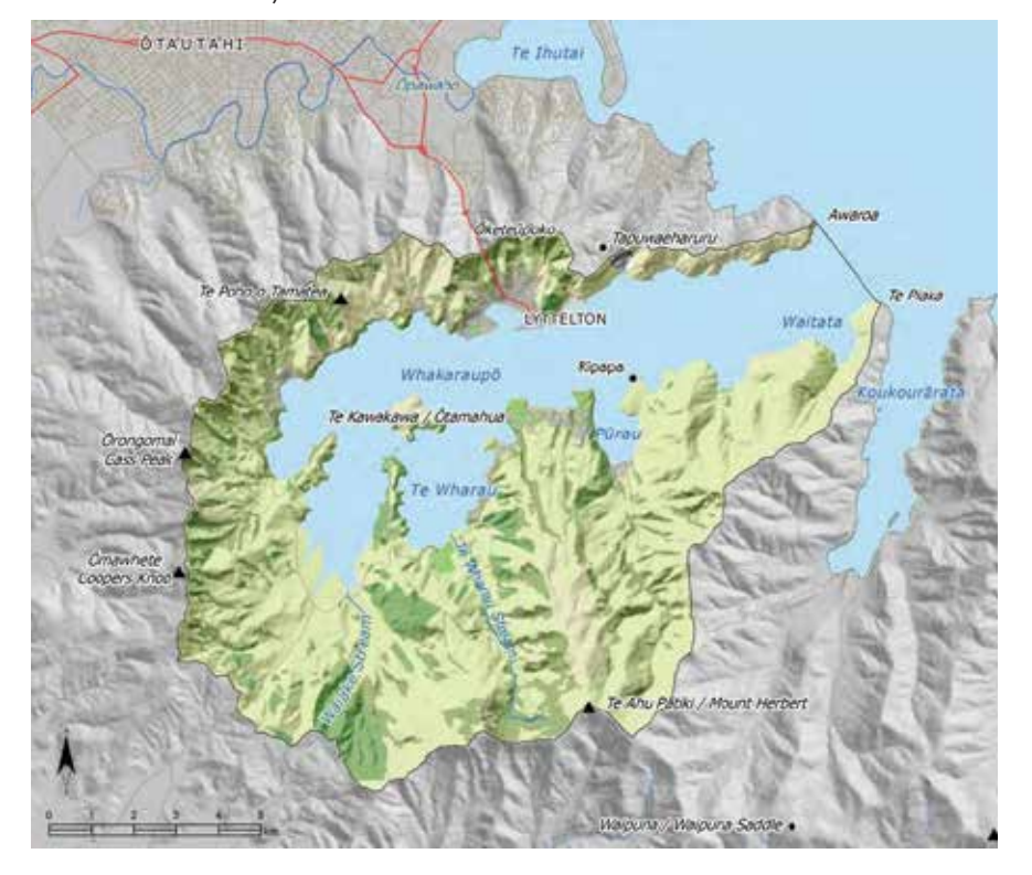
Figure 2: Whangaraupō - Lyttelton Harbour and Ōpāwaho directly to the rear (6.6 Whakaraupō - Mahaanui Kurataiao Ltd)

The land mass and coastal regions for each of our ECE sites can be seen in Figures 2 and 3 below. As far North as Whangaraupō Lyttelton harbour, over to Ngā Pakihi Whakatekateka o Waitaha – the seedbed of Waitaha stretches all the way from Ōtautahi (Christchurch) down to Te Tihi o Maru (Timaru) as shown in Figure 3 below.