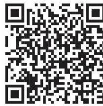
Book a Campus Tour