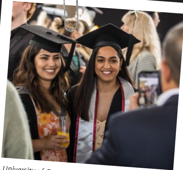
University of Canterbury August 2023