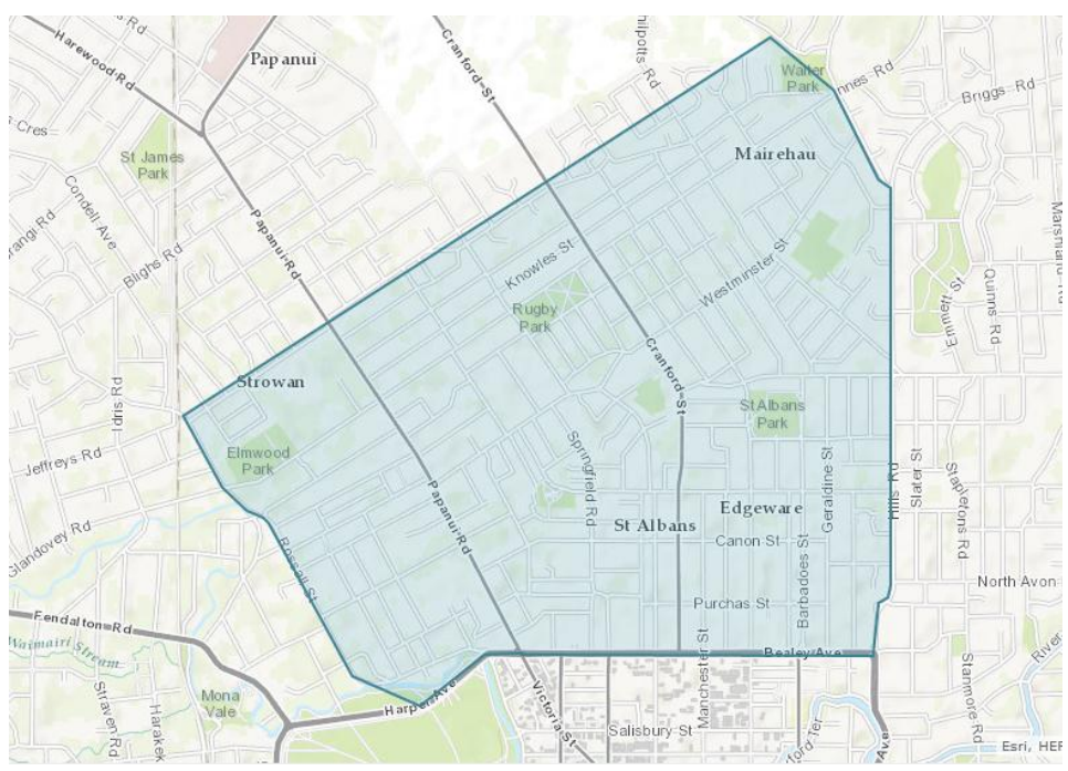
Figure 1 - Map of St Albans Area (ESRI, 2014)

SARA is an organization established in 1996 which aims to improve their local community. In 2013, SARA proposed a 20 point plan which would revitalize the community over the coming decade. One of these points was a "community food production programme" which aims to "promote local food growth and consumption", with an emphasis on food sharing. The community has many gardeners and a wealth of experience to pass on to other volunteers, but the challenge lies in finding a way to produce food in a very limited space. Some of the possible options to overcome this problem include green roofs and curb-side gardens, while land vacated due to the earthquake remains a possibility, albeit one riddled with legal hurdles. Increasingly, an important resource can also be found in the examples of other cities around the world. The success and failures of their food resilience initiatives can point SARA in the right direction, while helping them to avoid the pitfalls others have experienced.