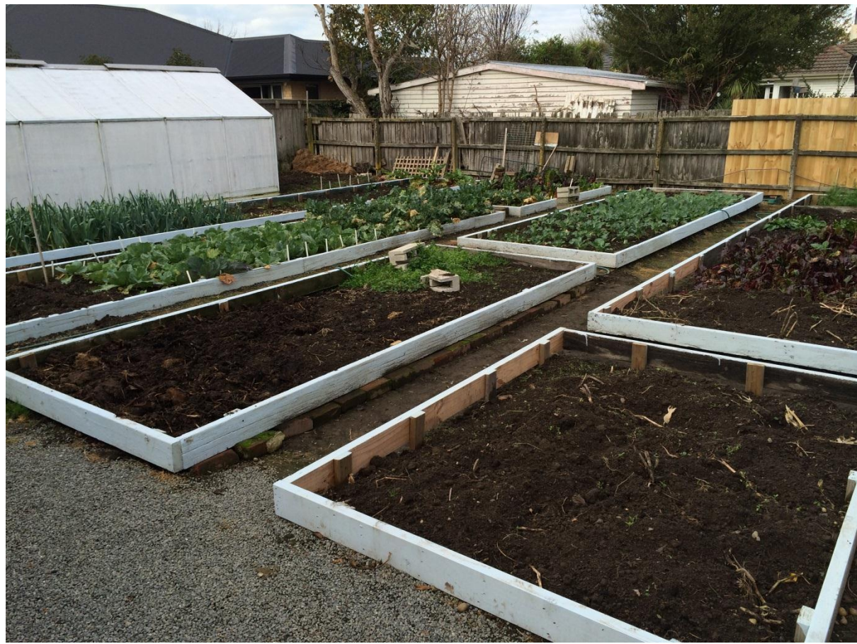
St Albans Uniting Parish Church Garden