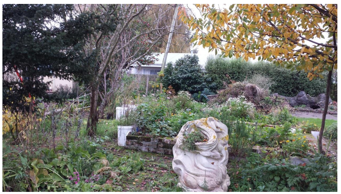
Figure 2: Packe Street Community Garden.

On May 15 we volunteered in the Packe Street Community Garden and had conversations with other volunteers. In many ways these informal conversations were immensely helpful. We learned a lot about the St Albans area, about food resilience in general, and about what relevant skills people in the community had.