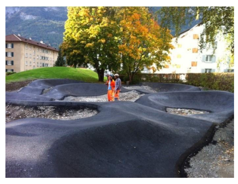
Figure 12: Asphalt pump track construction in the city of Chur, Switzerland (N.A, 2012).