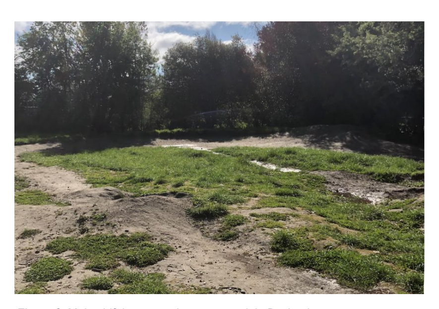
Figure 6: Makeshift jumps on the pump track in Beckenham

Currently used by the Beckenham youth, the pump track provides a safe zone to practise jumps or tricks with a BMX/ Bicycle on softer surfaces (dirt/ exposed topsoil), as seen in Figure 6. Despite a high frequency of use, according to