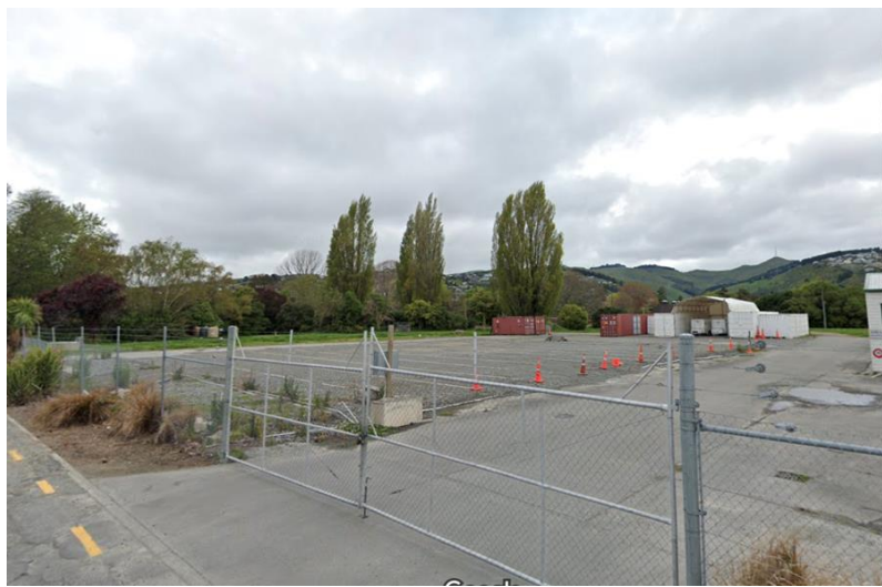
Figure 4: Civil defence space from the road adjoining the Southern library in Beckenham.

Recommendations for the usage of this space require further research and conversations between the BNA and CCC. The land is classified as freehold and owned by the council, meaning the council itself must sign off any usage. Therefore, the right person will have to be contacted.