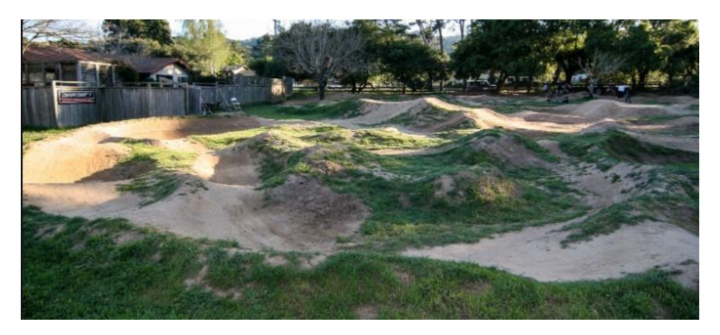
Figure 13: Dirt pump track example from the U.S.A (Bermstyle, N.D).