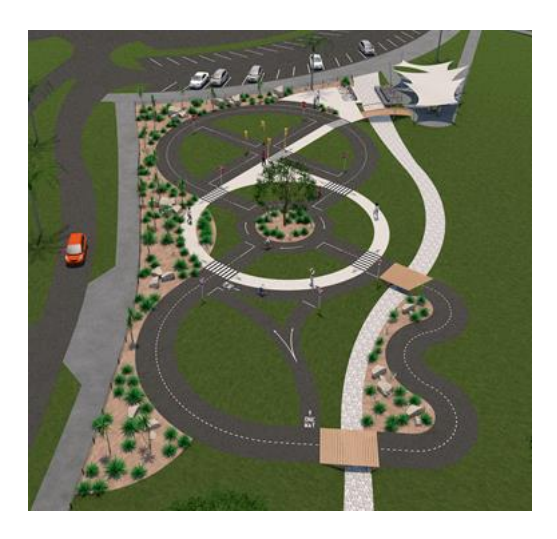
Figure 11: Caroline Bay learn to bike track, Timaru, New Zealand (Littlewood, 2020)