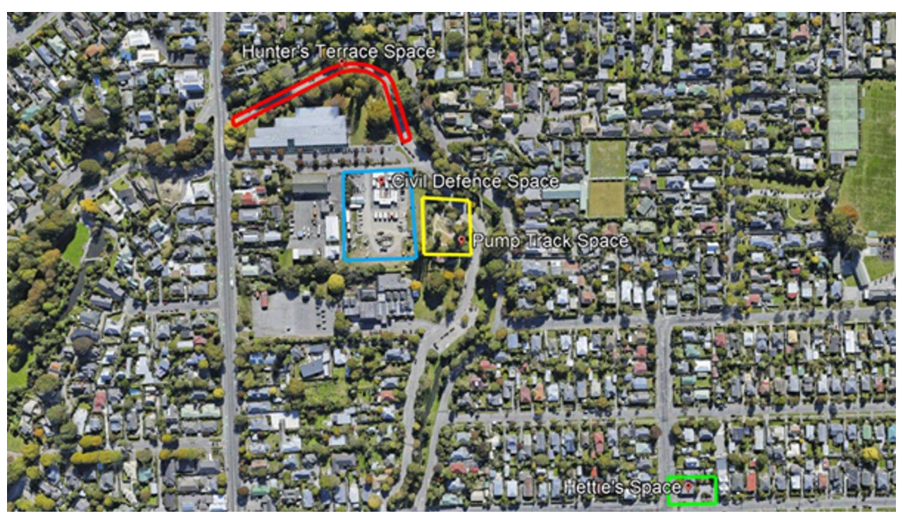
Figure 2: Map of Beckenham suburb showing the four vacant spaces. Hunter's terrace (red), Civil defence space (blue), Pump track (yellow) and, Hettie's crystal shop (green).

Vacant spaces appear more frequently in urban cities with constant expansions, new subdivision changes and land use adjustments. Beckenham is no exception as an outer suburb, the four vacant spaces associated along the Heathcote River on a border with Cashmere. These spaces shown in Figure 2 include Hunters Terrace tarmac zone (in red), Council freehold land (in blue), concrete outside Hettie's crystal shop (in green) and an informal pump track (in yellow). By recognising the potential for these vacant spaces, enhancements can be made to improve the current state of the areas. Communication between Christchurch City Council (CCC) and the Beckenham Neighbourhood Association (BNA) can also be strengthened. Through forming the research question, two key objectives were identified: researching legalities against development in these vacant spaces and identifying community aspirations for desired changes to the usage or state of each space.