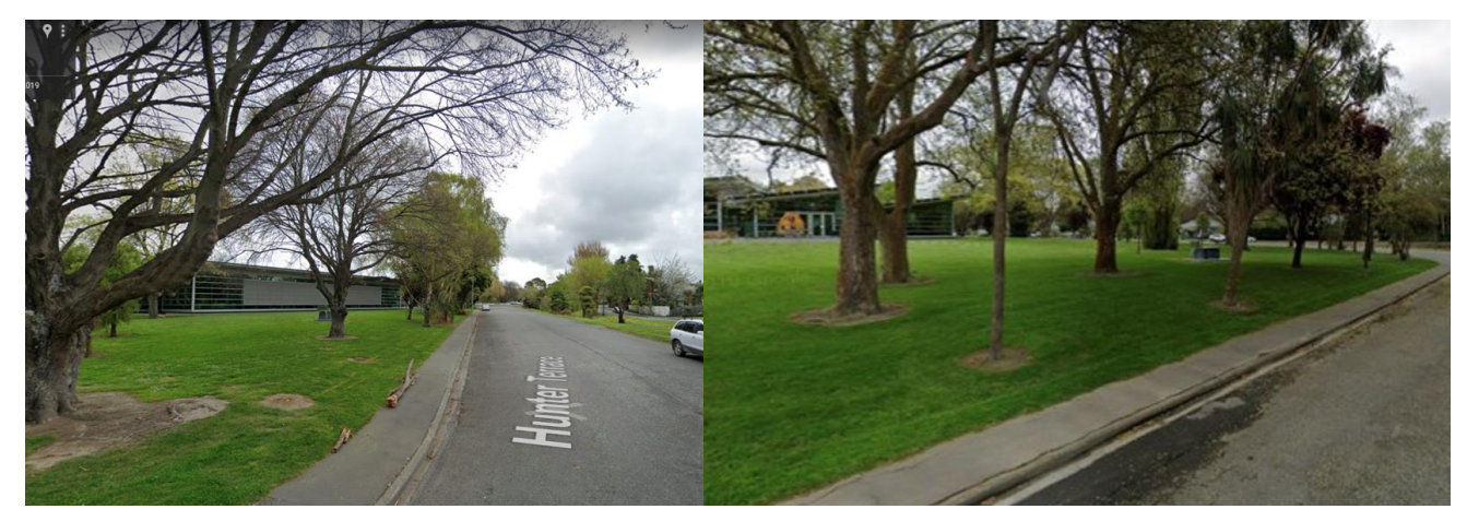
Figure 7: Tarmac area of Hunter's terrace (esplanade reserve) and green space with Southern library in the background.

Due to its relative size, Hunters Terrace has both the highest potential for change and the risk for negatively impacting the current state of the environment (shown in Figure 7). Majority of the focus within the interviews, surveys and impediments research focussed on Hunters Terrace due to these reasons.