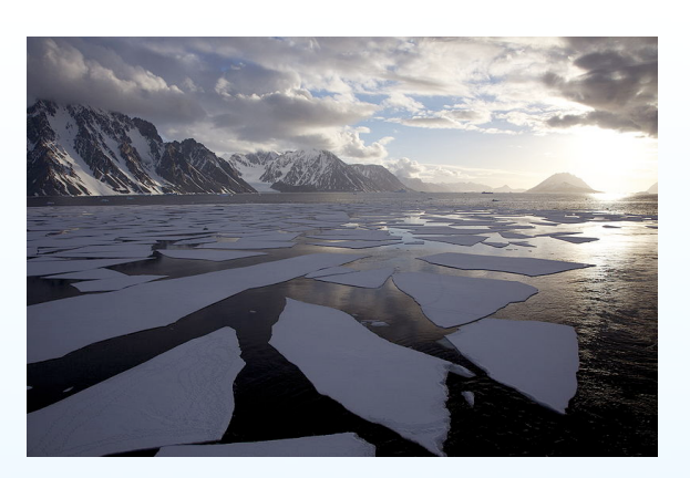
Midnight. A low sun is one reason Antarctica is so cold.

Finally, although these factors work together to keep both poles cold, Antarctica remains colder than the Arctic because it is surrounded by the Southern Ocean (rather than continents) whose relentless circulation around Antarctica acts as a barrier to warmer water and air moving southwards.