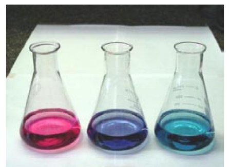
Figure 1 Colour changes for calcium-EDTA titration in clear sample solution using Patton-Reeder indicator. Left flask: pink/ red colour well before endpoint (excess Ca<sup>2+</sup> ions present to complex with indicator). Centre flask: last trace of purple colour just before endpoint (Ca<sup>2+</sup> ions almost all complexed by EDTA). Right flask: blue colour at endpoint (all Ca<sup>2+</sup> ions complexed by EDTA, indicator completely uncomplexed).