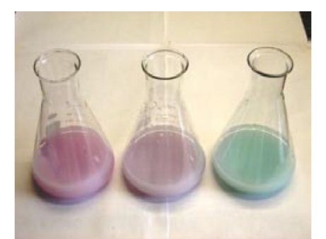
Figure 2 Same colour changes for calcium-EDTA titration as in Figure 1, but for cloudy (opaque) sample solution, eg milk. Left flask: pink/red colour well before endpoint. Centre flask: last trace of purple colour just before endpoint. Right flask: blue colour at endpoint

Figure 1 Colour changes for calcium-EDTA titration in clear sample solution using Patton-Reeder indicator. Left flask: pink/ red colour well before endpoint (excess Ca<sup>2+</sup> ions present to complex with indicator). Centre flask: last trace of purple colour just before endpoint (Ca<sup>2+</sup> ions almost all complexed by EDTA). Right flask: blue colour at endpoint (all Ca<sup>2+</sup> ions complexed by EDTA, indicator completely uncomplexed).