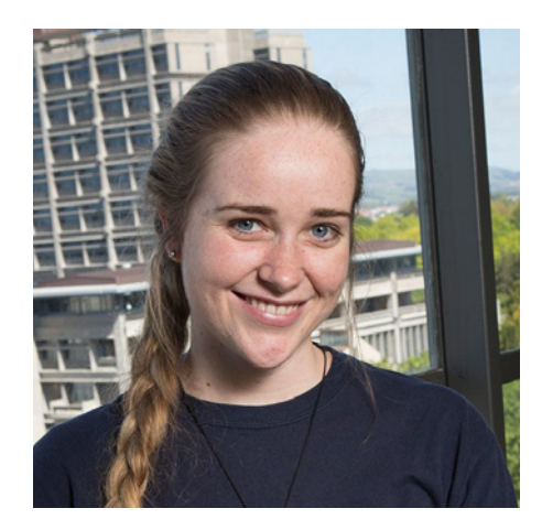
Bachelor of Science in Physics and Mathematics Honours Degree in Physics YouTube Content Creator