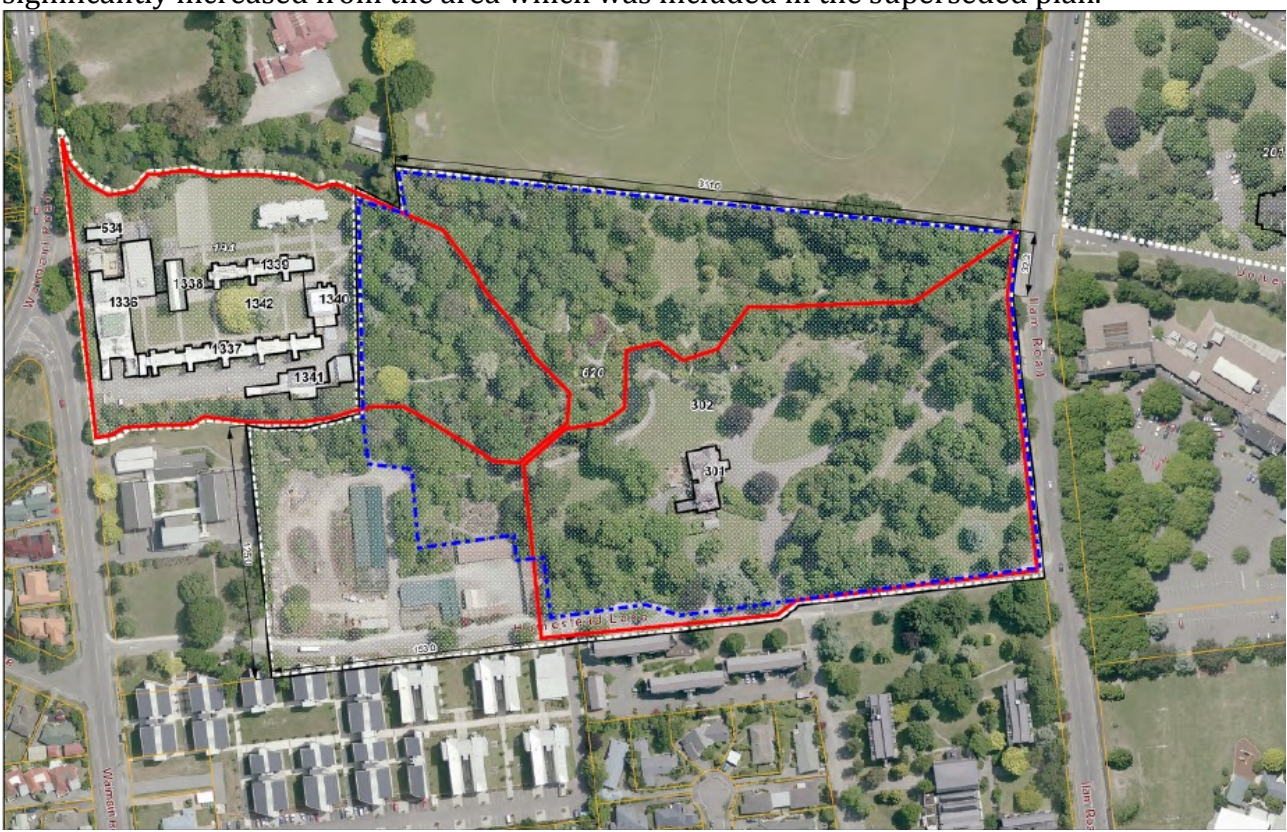
Image 1 – Showing boundaries of superseded, notified and proposed Heritage settings for the Ilam Homestead and Gardens overlaid on a single aerial photograph.

The following image is a compilation of all of these maps plotted onto a single aerial photograph and shows that whilst the area now determined is reduced from that notified in order to allow the University flexibility with the grounds depot area and buildings, it is in fact significantly increased from the area which was included in the superseded plan.