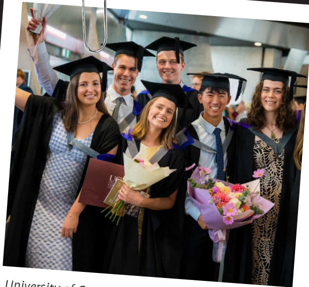
University of Canterbury April 2025