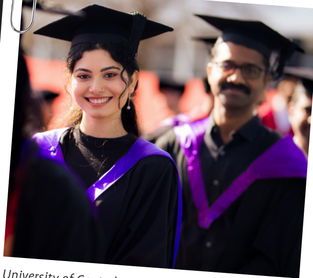
University of Canterbury April 2025