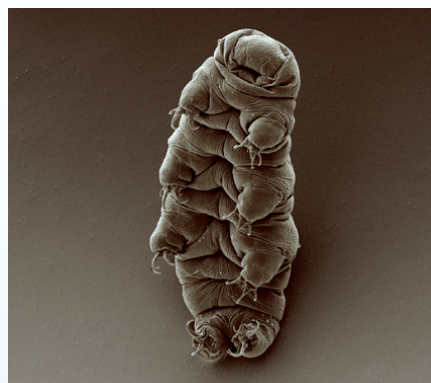
A Tardigrade or "Waterbear" (1mm high)

Without water ice cannot form, so by losing up to 95% of their body's water and becoming dormant some nematode worms and tardigrades can survive extremely low temperatures.