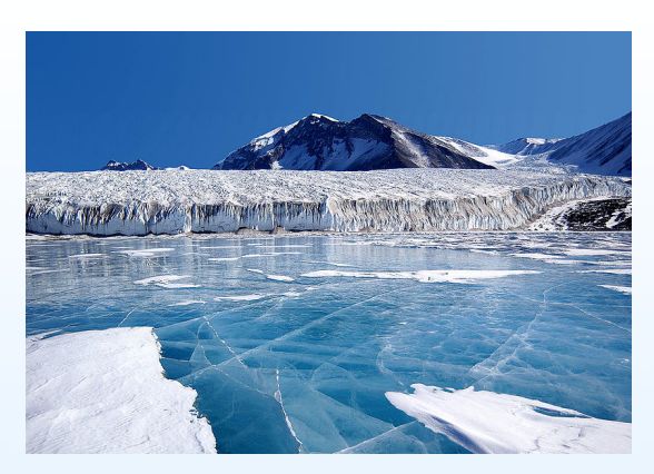
Lake Fryxell in the McMurdo Dry Valleys abounds with life in the water below the ice.

For a full range of Antarctic and Southern Ocean resources visit: The Antarctic Hub <u>www.antarctichub.org</u>